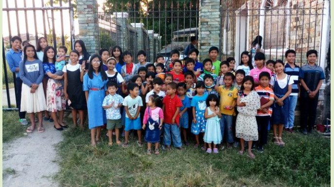
Recent group pictures of all 50 kids!