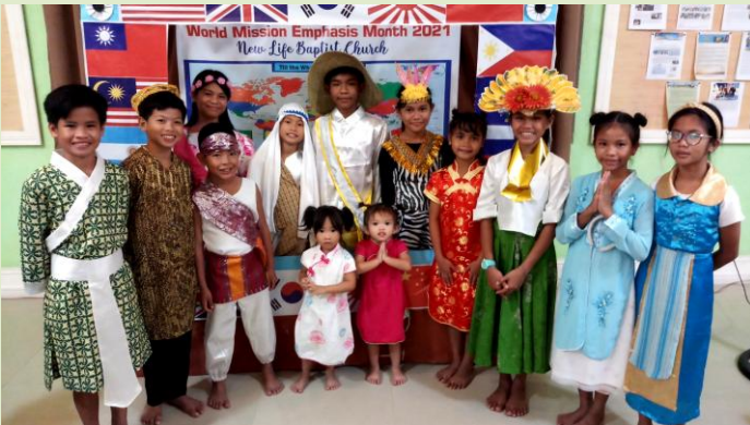
Some of the kids representing foreign nations at the church's world mission emphasis month!