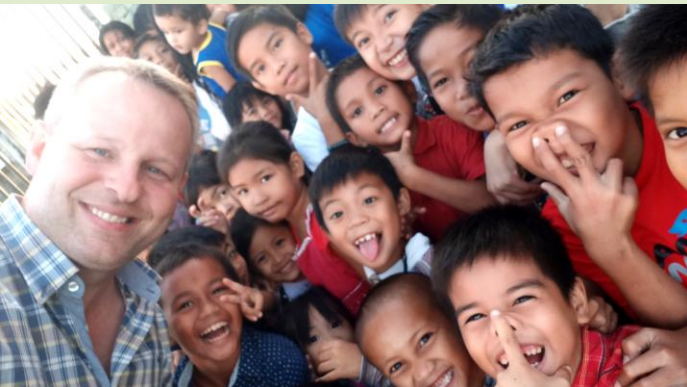
Always plenty of wacky faces around here!