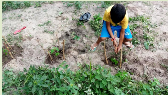
There's a lot of extra room now for gardening on the new land!