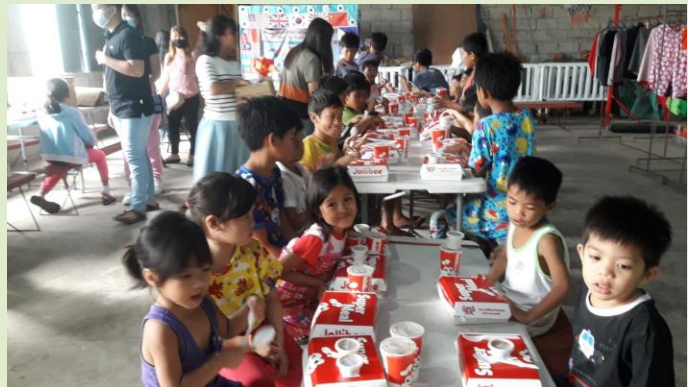
Thanks to friends for bringing a special lunch!