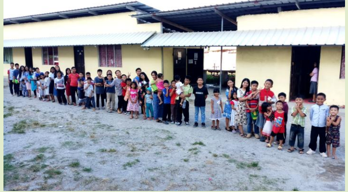
Recent group pictures at church! Aren't they a beautiful group of children!?