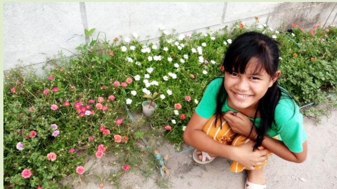
The kids enjoy planting flowers!