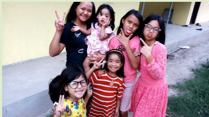
Of course there's always time to make silly faces!