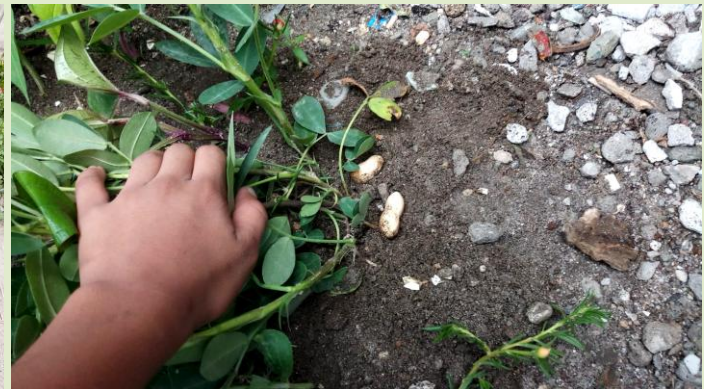
Look at that, some of the kids planted peanuts!