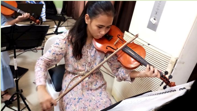
Playing in the mini orchestra at church!