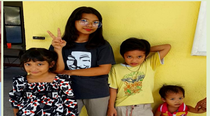
Welcome to these four siblings!