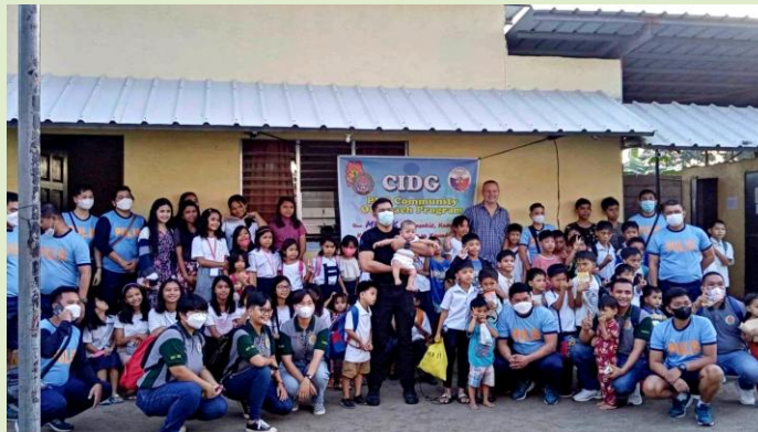
Thanks to some groups for visiting and being a blessing to the kids!