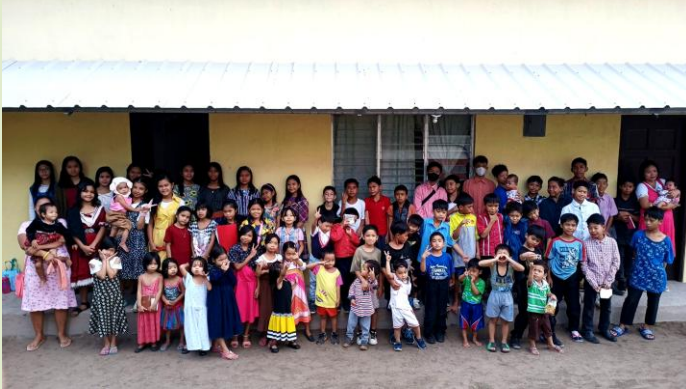
Recent group pic of all the kids!