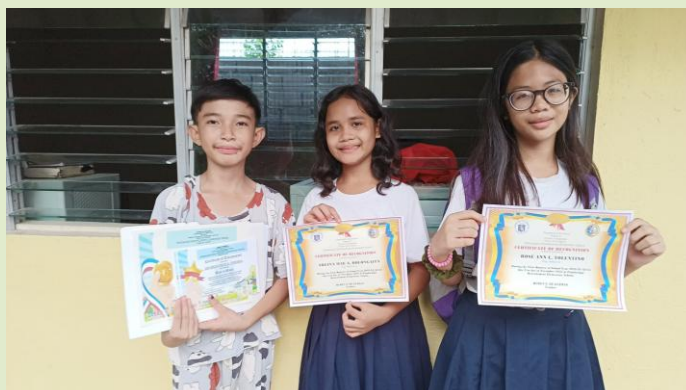
Some of the kids who recently got rewards at school!