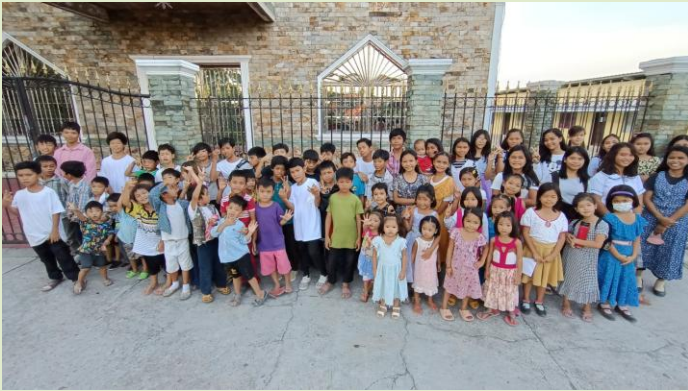
Recent group picture at church!