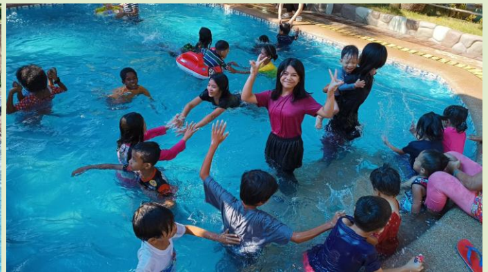
They had a great time at the swimming outing!