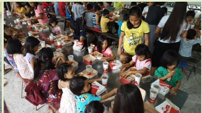
The kids are always excited to see those Jollibee motorcycles coming with special food!