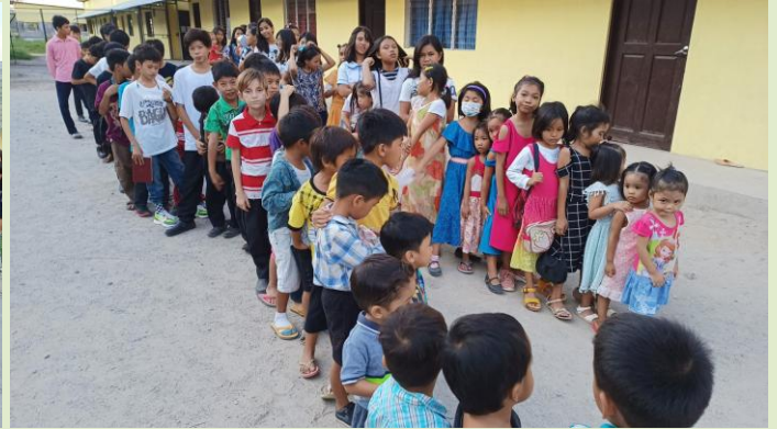
Everyone lined up and ready to go!